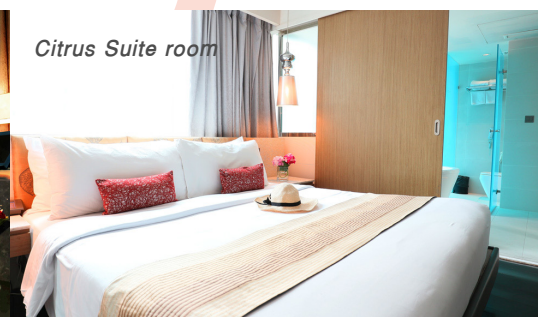
Citrus Suite room